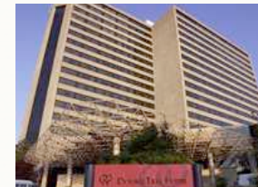
Accommodations available at the Doubletree Hotel