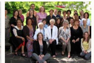
Training with an international flair.